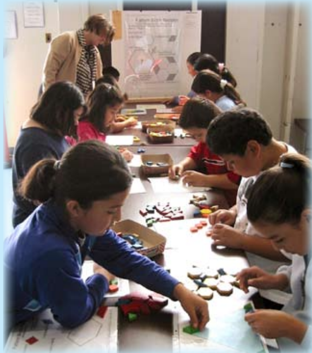
Students working at a typical Math Festival Station